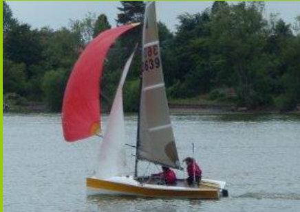
A Merlin Rocket