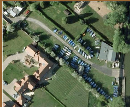
Earlswood Lakes SC from the air